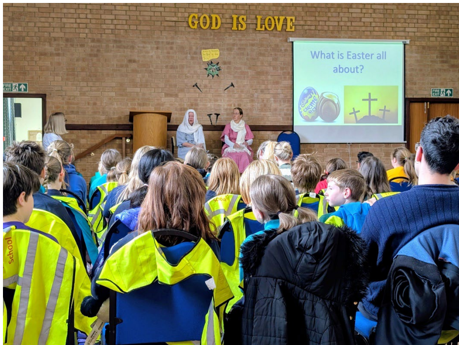
Easter Service at Bedford Court on April 27 th